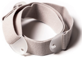
Universal belt HiMiV. 29.26.11.6999