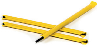
Bag clip HiMiV. 29.26.11.6999