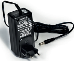
Fast charger HiMiV.29.26.11.6999